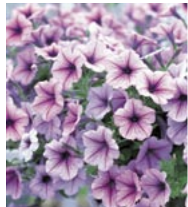
Petunia ‘Opera Supreme Lilac Ice,’ Park Seed Company

‘Opera Supreme Lilac Ice’ is a new trailing grandiflora petunia that offers a unique flowering pattern and a longer season of bloom. Instead of setting new blooms only at the end of each stem like other petunias, ‘Opera Supreme Lilac Ice’ flowers all the way to the base. This dense flowering eliminates the “empty center” look of many mature hanging basket plants. Trailing up to three feet long, this lovely plant begins the new season a few weeks ahead of other varieties and finishes several weeks later. The prolific blooms combine lovely shades of lilac and purple. A packet of 10 seeds sells for $3.95 exclusively from Park Seed Company, (800) 845-3369, www.parkseed.com .