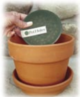
PotHoles® Drainage Discs Aspen West Partners, LLC