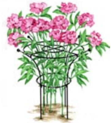
Essex Plant Supports Gardener’s Supply

Tall flowers such as peonies are spectacular in the garden, but they often end up with their heads on the ground when the first rainstorm hits. Essex Plant Supports are designed to be sturdy and attractive as they support upright flowers. The 6mm steel uprights are powder coated for durability, and the graceful arc supports stems and flowers naturally, like a garden bouquet. When the growing season is over, simply snap them apart for compact storage. A set of two Essex Plant Supports sells for $24.95 (extra large– $29.95) exclusively from Gardener’s Supply, 1-800-955-3370, www.gardeners.com .