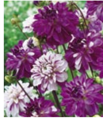
Changing Colors Dahlia Dutch Gardens

Dutch breeder Pim Hoekstra discovered Changing Colors Dahlia in a group of his dahlia trial seedlings. Each flower on the plant is different because the flower undergoes a dramatic color change as it matures. Some of the flowers start out white and develop lavender and purple coloration, while others start out lavender or purple and mature to white. Every 4-inch to 5-inch flower is unique, giving this plant a truly unique appearance. Changing Colors Dahlia grows 24-26 inches tall and 18 inches wide and blooms from mid-summer to fall. Three top-size clumps sell for $12.95 exclusively from Dutch Gardens, (800) 944-2250, www.dutchgardens.com .