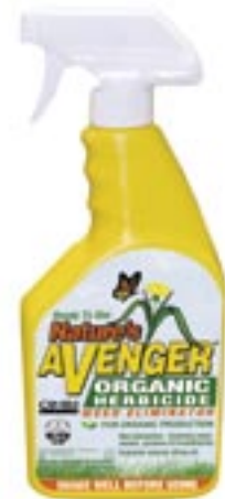
Nature's Avenger Organic Herbicide Beaty Fertilizer, Inc.

Nature's Avenger Organic Herbicide is a fast-acting citrus oil-based herbicide that strips off a plant's waxy cuticle. Just spray it on a weed and the resulting dehydration leads to the death of the plant. The citrus aroma is a pleasant change from the oily odor of other herbicides. The active ingredient in Nature's Avenger is d-limonene, which naturally occurs in citrus rinds. Nature's Avenger is child, pet and environmentally friendly, and it is OMRI listed for organic gardening. Nature's Avenger in a ready-to-use spray bottle sells for $14.99 postpaid from Beaty Fertilizer, Inc., (800) 845-2325, www.millsmix.com .