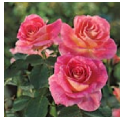
Lovestruck Jackson & Perkins Roses

Lovestruck is one of the brightest, showiest floribunda roses ever introduced. Each bloom is a work of art—from the handpainted look of glowing hot-pink petals to the dramatic white reverse. Large clusters of bright 4-inch ruffled blooms are borne on long stems on a compact, highly disease-resistant plant. Lovestruck's tidy, rounded shape and compact 3.5-foot height make it a perfect container rose in an urban garden setting. The vigor and continuous blooms also make Lovestruck an ideal plant for a dramatic mass planting. Plants sell for $16.95 exclusively from Jackson & Perkins Roses, (800) 872-7673, www.jacksonandperkins.com .