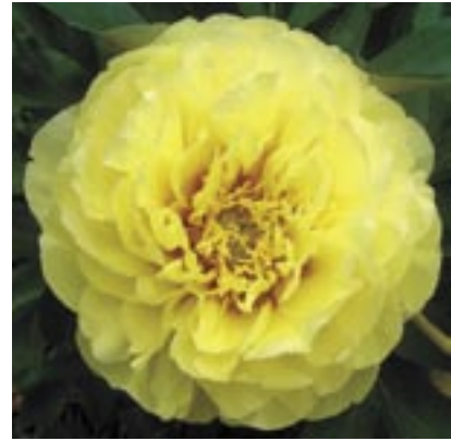
Peony Bartzella Wayside Gardens

Peony Bartzella is one of the new hybrid crosses between a tree peony and an herbaceous peony. This delightful plant offers gardeners the wonderful heavy blooms of a tree peony with the nice compact form of an herbaceous type. Bartzella is a beautiful double yellow flowering form that performs well to USDA Zone 8. Plants sell for $29.95 exclusively from Wayside Gardens, (800) 845-1124, www.waysidegardens.com .