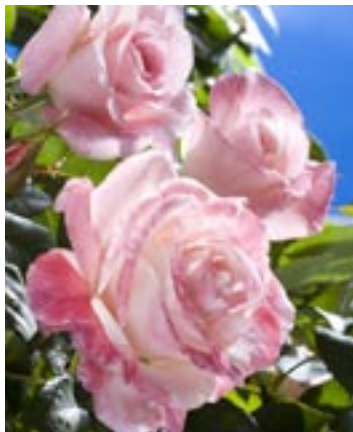
April in Paris Jackson & Perkins Roses